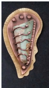
Hip to be Square

Technique: Brazing, Cold Connections, Design, Metalsmithing, Metalwork, Riveting, Soldering, Stone Setting - Cabochon, Texturing, Wire Work