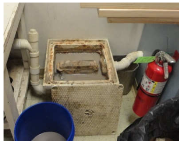
Mud trap